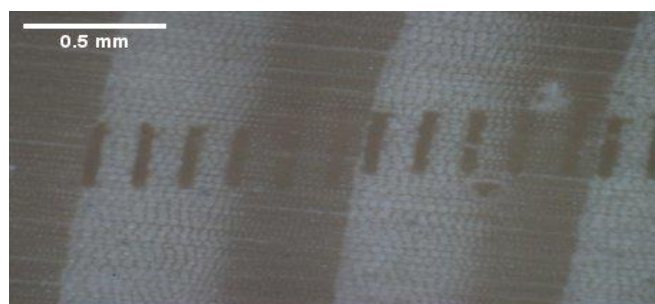
Picture1 Showing the sampling tracks of ablating laser over early and late wood of tree rings. Using this technique many measurements can be made on each tree ring.

LA-IRMS allows the sampling of a tree ring in situ using a 213 nm laser, negating the time consuming and laborious manual slicing and weighing of the samples into tin cups for \delta^{13}\text{C} analysis. For LA-IRMS analyses, the only required sample preparation steps are the smoothing of sample surface for laser beam focusing and the removal of mobile phases (resins). Further, LA sampling tracks can be easily positioned so that they accurately follow the cell structure of the tree-rings as desired.